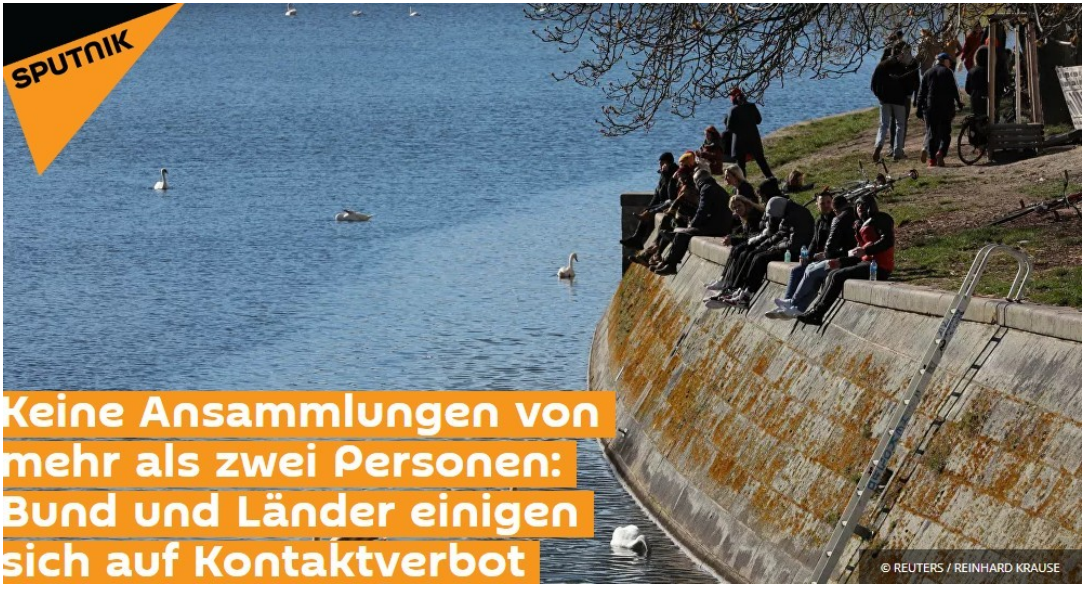
A park in Berlin-Kreuzberg, 22 March 2020

No contact16:00 22.03.2020