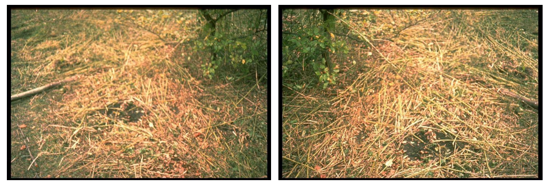
The dark spot next to the small beech, seen from opposite directions

Here, too, it must be admitted that the process of " elimination of a tree back into the past, molecule by molecule, can only be noted, but hardly understood in detail, even if Ptaah has in the meantime explained this in rough outlines (see page 8/9).