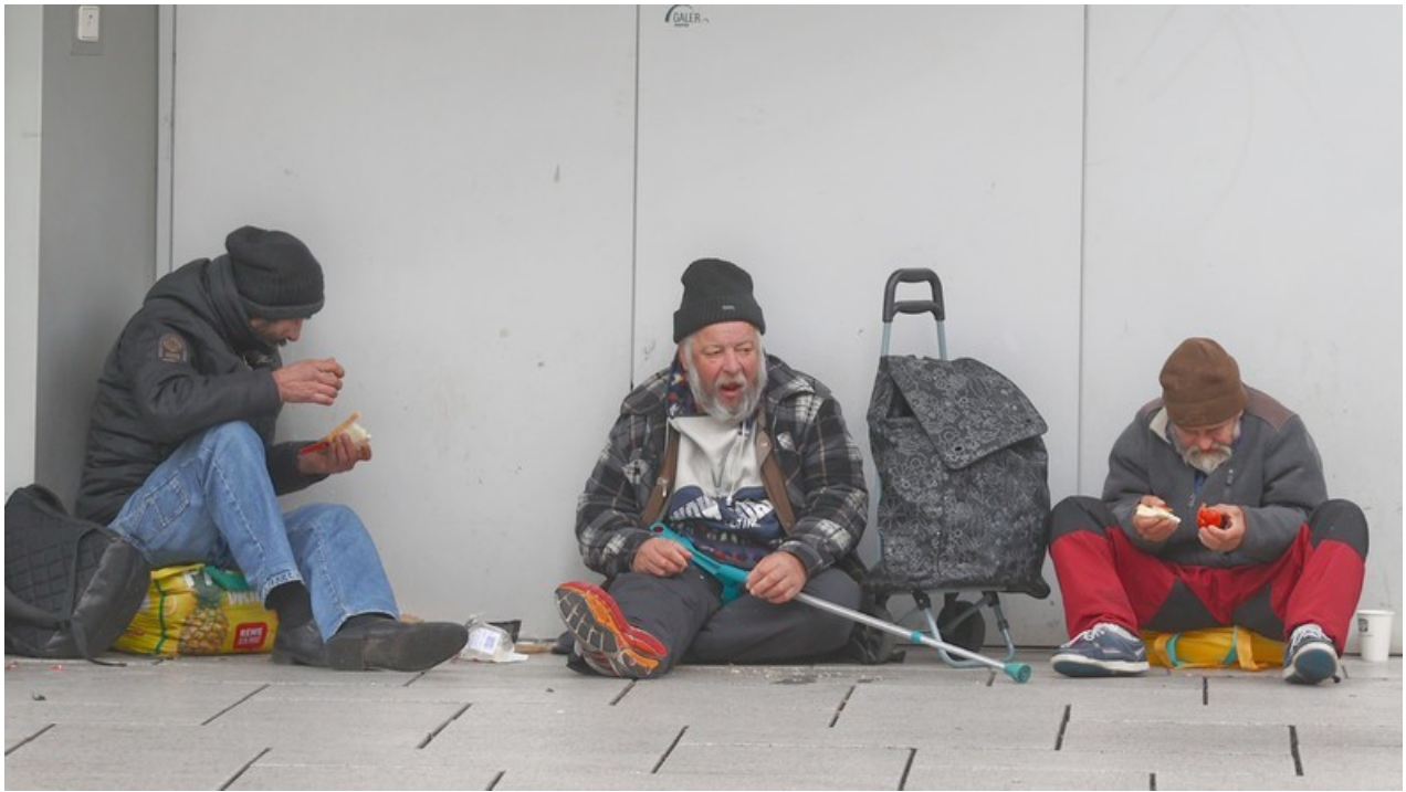
Homeless people in the shopping street "Zeil" during a partial closure, Frankfurt, 21 March.