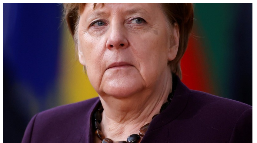
Island gift? Angela Merkel at the EU summit in Brussels on 20 February. (Note Billy to the picture: Question: Oh Lord, why am I so stupid as chancellor? - terrible!)

5.03.2020 - 10:42 a.m. m https://de.rt.com/248h Germany 2020: Failure in times of pandemic