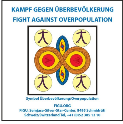
Original symbol overpopulation

The federal government has all the media and executive means of power to manipulate the measures and has been using them for a long time. Even now, as the contents of the Seehofer study and the way it deals with them show. After the COVID-19 pandemic has subsided, this revelation of ruling incompetence and its lasting damage must be put back on the table. Source: https://deutsch.rt.com/meinung/100749-reif-fur-abwahl-kabinett-merkel/