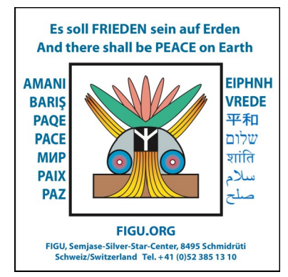
The Billy Meier case: true or false? Continued on next page 2:

use your car and stick the right peace symbol on it and spread it around!