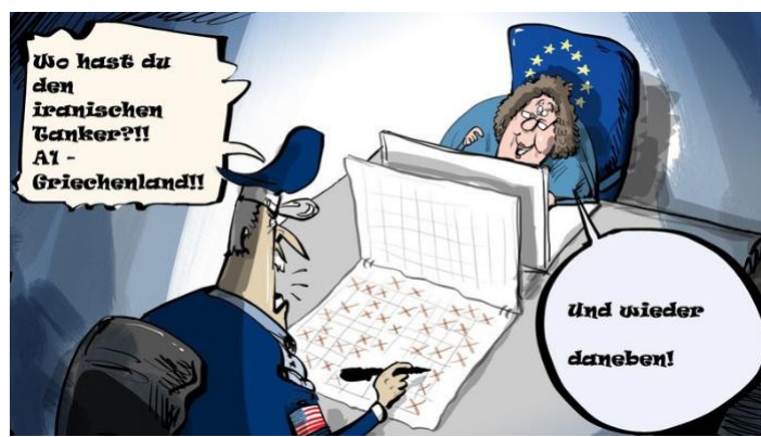
Europe's full-blown Stockholm syndrome in the face of US bullying

Relationships. But previous governments in Washington at least made sure that the European countries as "partners" in an apparently mutual alliance.