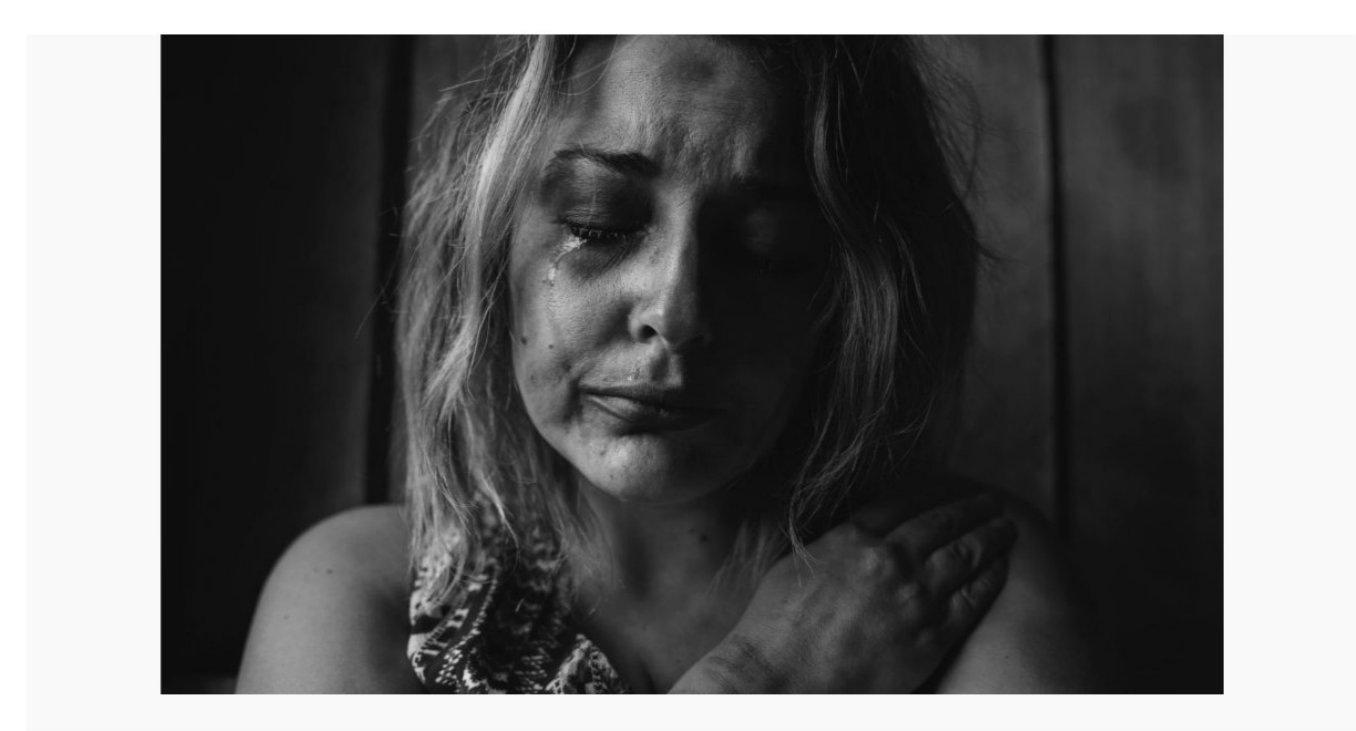
Alarming increase in violent crime Violence against women is increasing on a more than worrying scale. Corresponding headlines dominate all media.

We do not doubt the correctness of this frightening development in any way. We, the "Schweizerzeit", the SVP, the Auns and sifa have been documenting this development for years. And for years we have been strongly criticising the laissez-faire attitude towards this spread of violence.