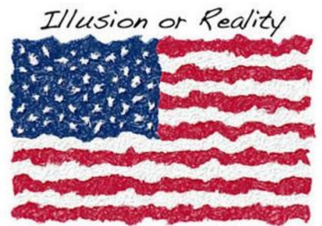
The American dream: illusion or reality?

When I came to Russia for the first time in 2009, I was a little surprised at the positive attitude the Russians had towards America and Europe. People I met gave me the impression that they admired the West and thought everything was super good there. Especially towards Germany and the Germans they were very good to talk to. My attempt to explain to them that not all that glitters is gold, that the West is not a paradise, that there is much bad there, they did not want to hear. Their image of the West was strongly influenced by Hollywood films and Western propaganda in general.