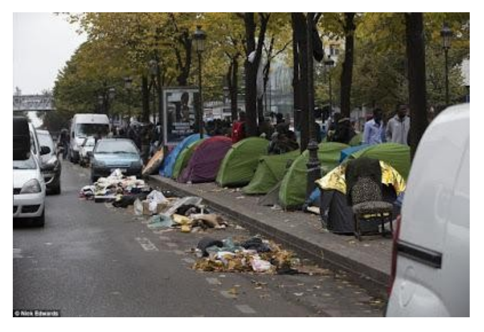
Yes, the photos show Paris and not some third-world slum!

I said to them that they completely underestimated their country and overestimated foreign countries. If they were to travel to Europe and North America, to see what reality is like, they would come back completely disappointed. The only city that comes to mind as comparable might be Paris. But even this cultural metropolis was once, is run down and decayed.